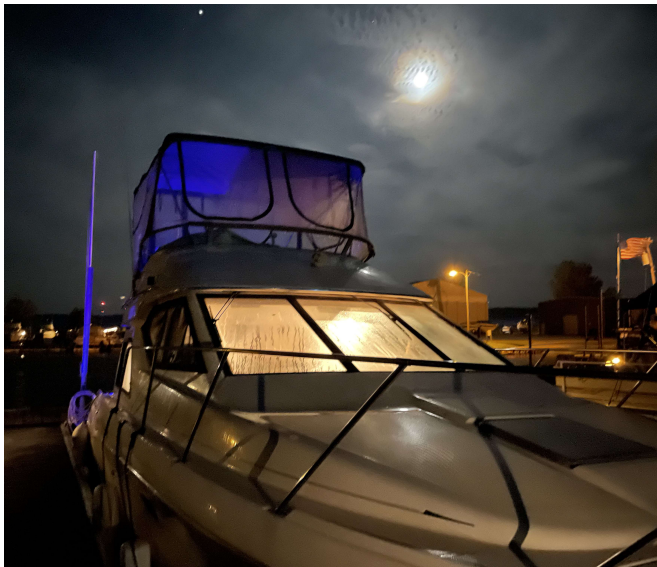
Another boating season coming to an end!