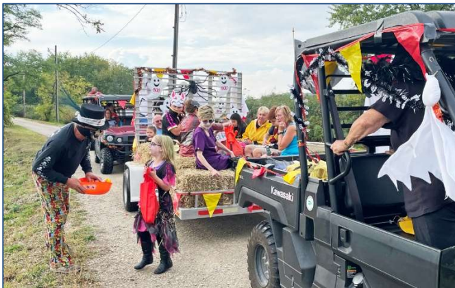
Trick or Treating (See attached collage for more pictures)